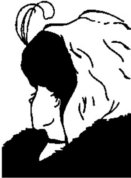
Figure 5. Seeing multiple perspectives at the same time