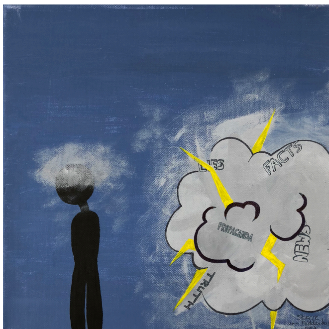
Figure 3. The liminal effects of the fog of cyber-war in creating thick air. Painting by Sterre van Middendorp

the effect of the complex interaction between content and body-mind created with the goal to either draw as much attention for as long as possible, or conversely, desensitize. In the (new) media, attention is the new currency (Wu, 2016), and content creators have taken the leading edge on this front by leveraging an emerging body of empirical knowledge about our subjectivity, derived through second generation cognitive science 4 (Lakoff & Johnson, 1999). Gains in scientific knowledge about the working of our subjectivity and our neural embodiment are used to shape these interactions and to capture us in whatever frame the creators have in mind. In the case of the phenomenon popularly referred to as fake news, the line between metaphor and reality becomes thin, which can be disconcerting and disorienting, forcing the emergence of a liminal (cyber)space. This takes us to the third painting shown at figure (3), in which the conflict generated among competing narratives, antenarratives and purported facts serves to generate a cloud of thick air around the protagonist.