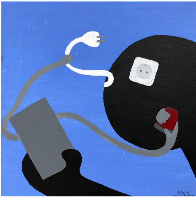
Figure 2. Disruptions at the interface of human-computer interaction. Painting by Sterre van Middendorp

In the next painting at figure (2), we zoom in more closely on the inner dimensions of the lived experience of the protagonist: