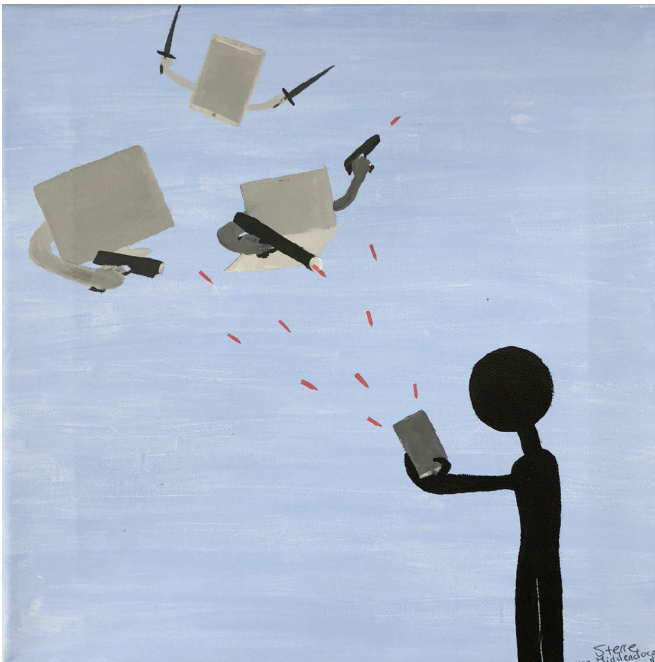
Figure 1. A view of the daily information assault from cyberspace. Painting by Sterre van Middendorp

war among competing antenarratives to change what may currently be regarded as truth by capturing collective attention. Our purpose in this is to raise our awareness of what may be going on in the relationship between the fabrication and delivery of fake news, the impact on existing structures of meaning and typification around what is true, and the emergence of a new (intersubjective) sense of truth within the lifeworld. Within this metaphor, persons encountering antenarratives that they perceive as fake news may indeed suffer from a form of moral injury, experiencing something of the liminality that can often surround the warrior in combat. To illustrate this phenomenon, we will use the paintings that Sterre van Middendorp created specifically to support our presentation, from the perspective of a young person who has grown up as a digital native among mobile devices, online social worlds, and the action-logics of the world wide web. The first of these, in figure (1) below, shows a user of digital devices which are figuratively under attack in a cyberspace war of news and information: